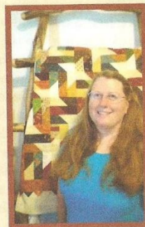
Quilting Group Leader