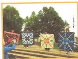
Paducah Outdoor Trunk Show