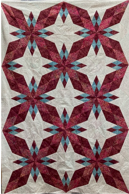
Sample size 50" x 74'

Put an old fashion pattern in your new quilt. Looks complicated but actually it goes fairly fast once you learn the technique for piecing setting triangles. Can you figure out where the block starts and ends?